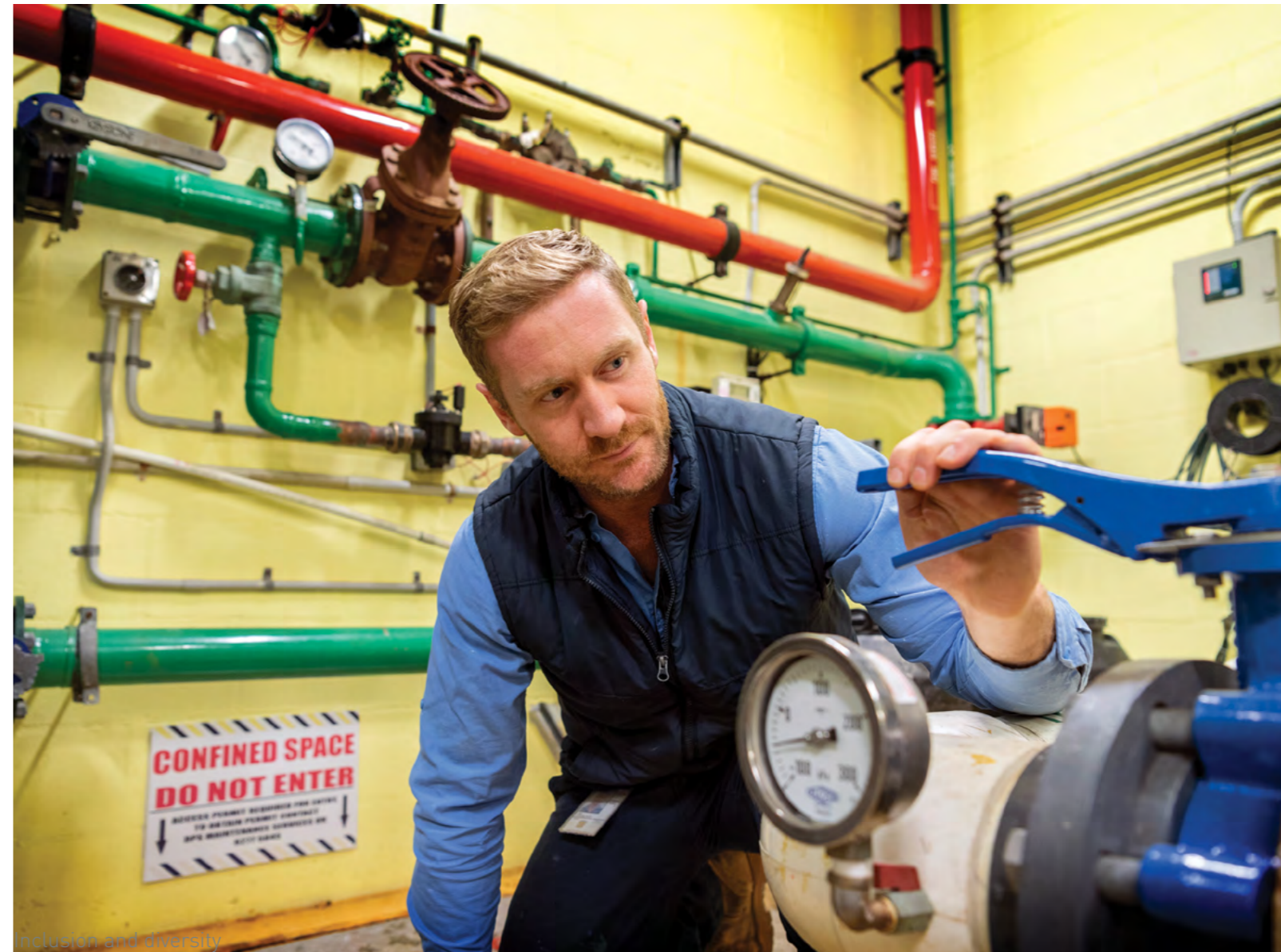
Inclusion and diversity