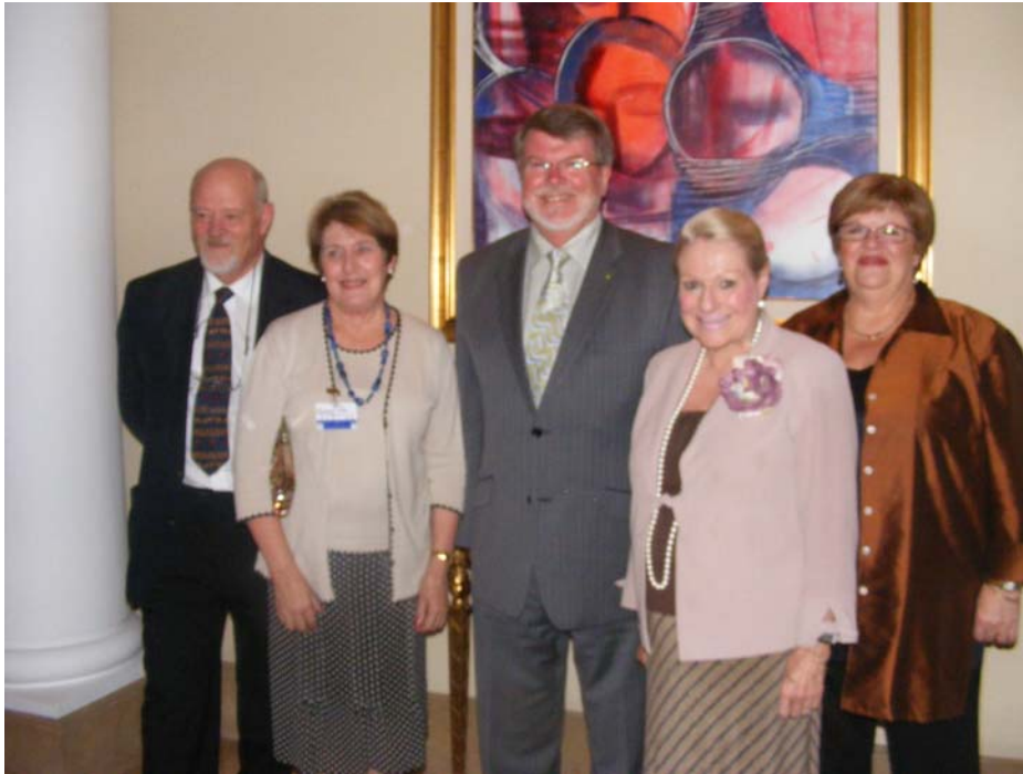
Members of the Delegation

The delegation therefore considers that the program for outward parliamentary delegations should include specific programs to visit UN agencies and other international organisations.