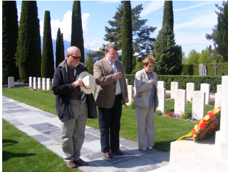
Members of the delegation laying a wreath at the Commonwealth War Graves at St Martin's Cemetery, Vevey, near Montreux, Switzerland

8.174 It was truly a privilege for the Australian delegation to honour these young Australians who died in the First and Second World Wars.