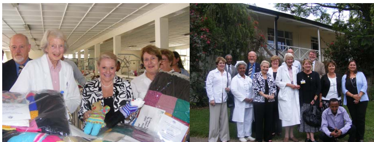
Members of the delegation with Dr Catherine Hamlin and the staff of the Fistula Hospital, Addis Ababa