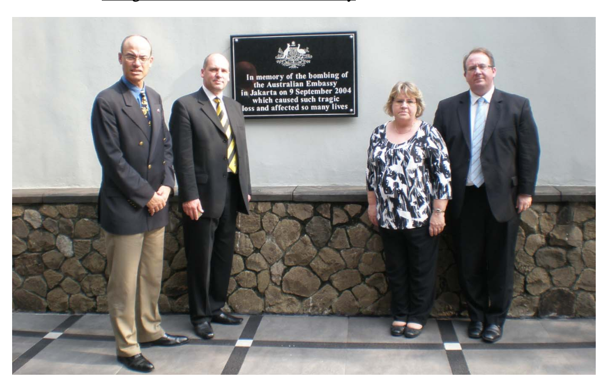
The Senate Committee in front of the memorial for the 9 September 2004 bombing of the Australian Embassy