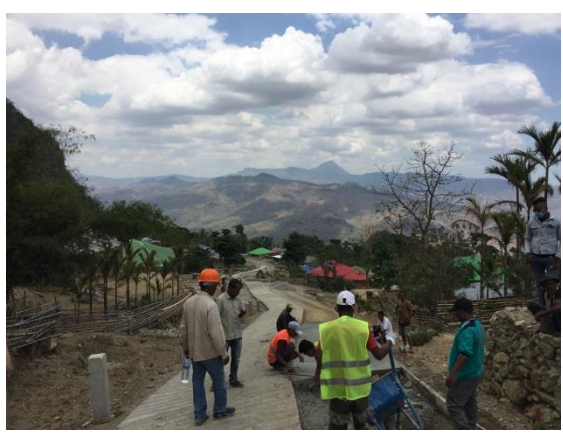
Rehabilitation of the Maliana-Saburai road

Finally, the delegation visited a salt farm at Surilaran, Atabae, operating with support from the Market Development Facility (MDF), a multi-country private sector development program. MDF supports private sector businesses to provide market opportunities which will in turn facilitate employment and enterprise in local communities.