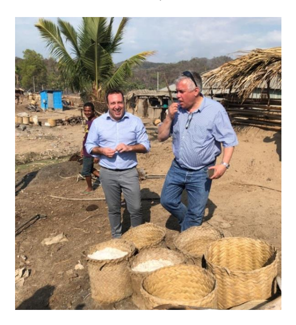
Ambassador Roberts and Senator Rex Patrick taste locally-produced salt at Surilaran, Atabae

Members of the cooperative also raised with the delegation their need for a secure shed to store the salt while awaiting collection, to better protect it from the elements and enable them to increase production.