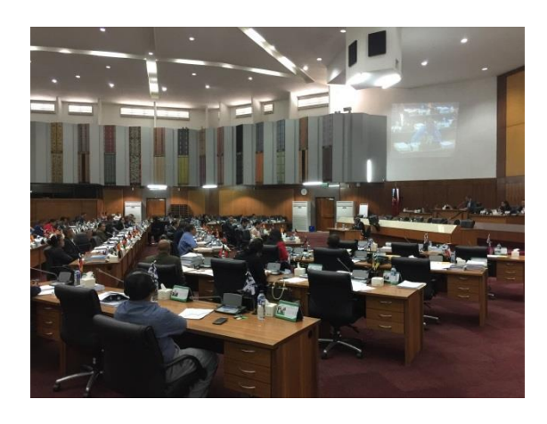
Timor-Leste's National Parliament in Plenary Session, 29 October 2018

The delegation visited the Parliament of Timor-Leste, and observed a 'Plenary Session'. The Parliament meets in Plenary Session every Monday and Tuesday to consider motions and bills. During the delegation's visit the major item before Parliament was the 2019 national Budget.