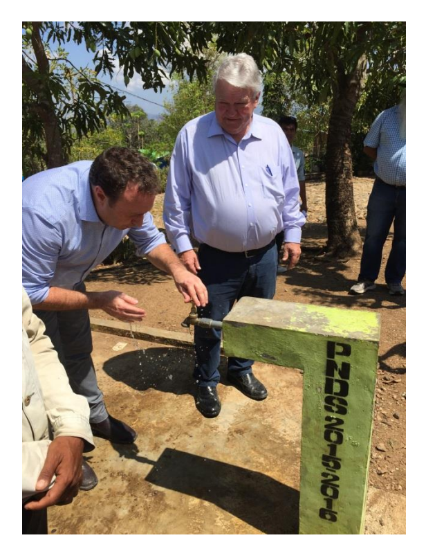
Ambassador Roberts and delegation leader Ken O'Dowd MP test the water at Suku Odomau

In 2016 the community at Suku Odomau decided to prioritise access to clean water in five villages where people had previously needed to walk a long way to obtain fresh water from a river or spring. For a total cost of US $13,000, a water tank, almost 3km of gravity-fed pipeline and five taps were installed, providing clean water to approximately 90 households.