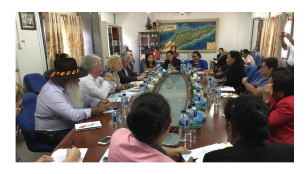
The delegation meeting with the Parliamentary Women's Group (GMPTL)

and promoting an inclusive legislative agenda on issues affecting women, children and other vulnerable people.