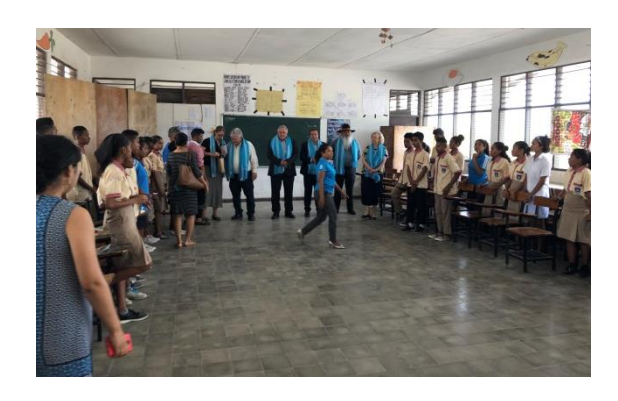
The delegation observing a reproductive health class in progress at Liquica Secondary School

More generally, Mr Nunes observed that this was the only public high school in Liquica, and had grown rapidly since it was established in 1993, from less than 100 students to almost 1900 across two campuses today. Individual classes sometimes had up to 100 students, and the principal emphasised the need for more classrooms so that class sizes could be reduced.