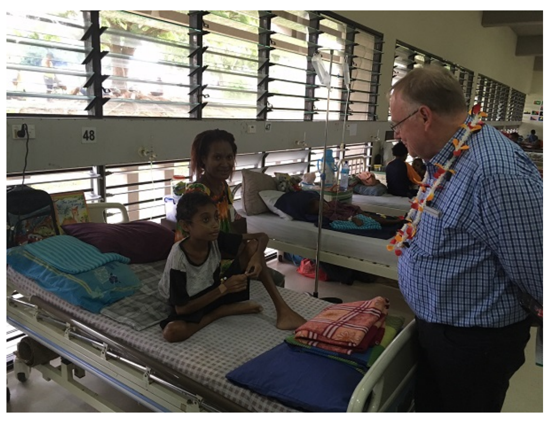
Figure 2.5 Children's tuberculosis ward, Port Moresby General Hospital