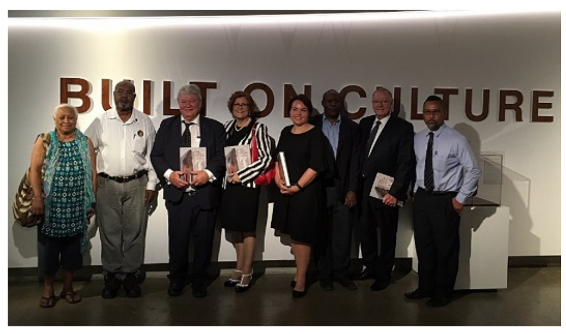
Figure 2.2 National Museum of Papua New Guinea