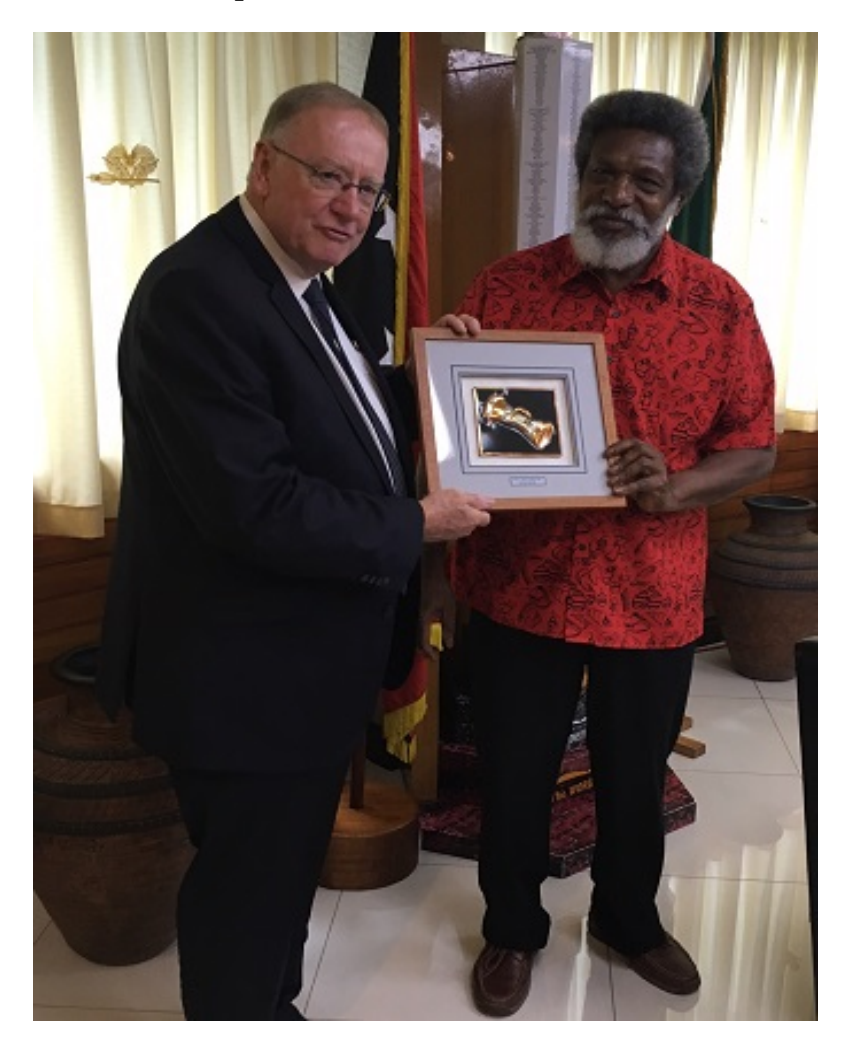
Figure 2.1 Senator the Hon Ian Macdonald and the Hon Job Pomat, Speaker of the House, Papua New Guinea