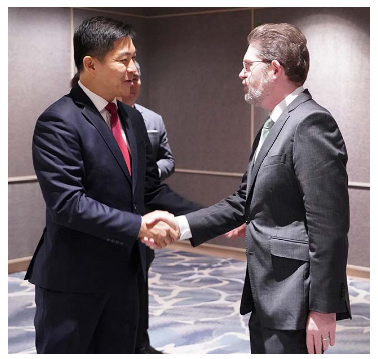
Figure 1.1 AIPA President greeting the Australian Delegation Leader