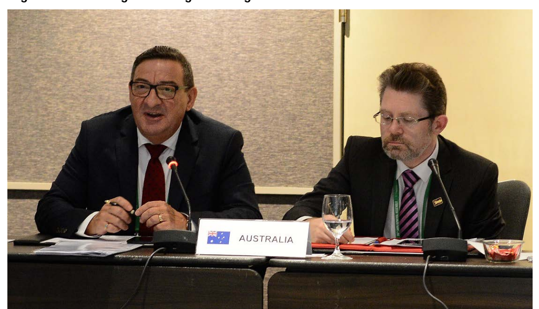
Figure 1.3 Delegates during the dialogue session

1.51 He then outlined Australia's ongoing political debate around policies to deal with climate change, acknowledging the divide in politics on this issue which was demonstrated by the repeal of Australia's price on carbon. He also highlighted that Australia is a committing to substantial reductions of emissions on a per capita basis.