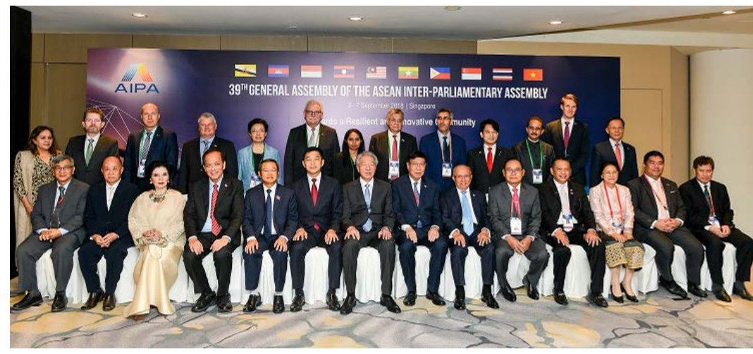
Figure 1.2 Group photo of delegation and guest leaders