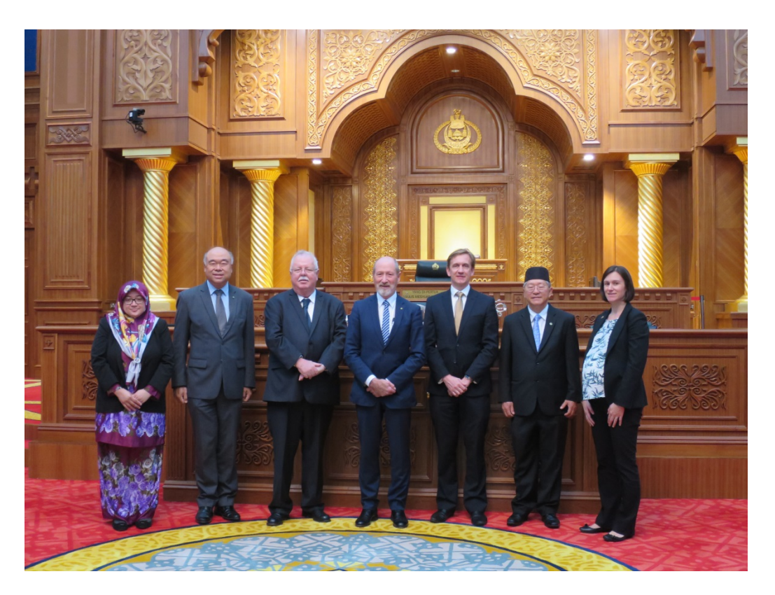
The delegation was welcomed by members of Brunei's Legislative Council.