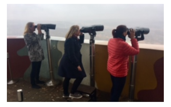
Delegation Members looking out across the demilitarized zone on the Korean peninsula

this could have on the economic and social fabric of Korea. The delegation heard that over time there had been some occasions where family members who were separated by the political boundaries of North and South Korea had brief reunions (a few hours or a day) or in some cases not at all since the early 1950s. While reunification was discussed in the context of the current political environment of the Korean peninsula, it was acknowledged that with the now frequent passing of people who had been affected by the annexation of Korea, the issue of familial ties and reunion was a weakening driver of reunification. Societally it was acknowledged that, while still hopeful, most Koreans did not believe they would see the reunification of Korea in their life-time.