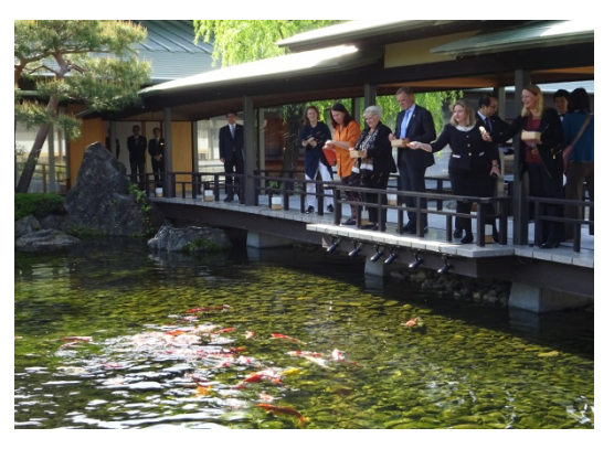
Delegation Members partaking in the traditional feeding of the Koi fish (Amur Carp), Kyoto

The delegation was honoured and privileged to witness Kyoto Geisha known as Geiko or 'arts child' perform a traditional dance accompanied by a shamisen player (three-stringed traditional Japanese musical instrument). The delegation ended its stay in Kyoto with the feeding of the Koi fish (Amur Carp) a traditional gesture of friendship and to welcome good luck and prosperity.