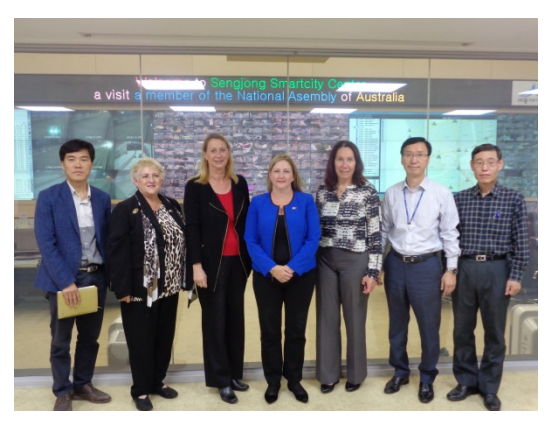
Delegation Members at the Administrative City, Sejong, Smart City Centre, RoK

<sup>9</sup> National Agency for Administrative City Construction, Korean Land & House Corporation, Administrative City , Sejong Guide, Brochure.