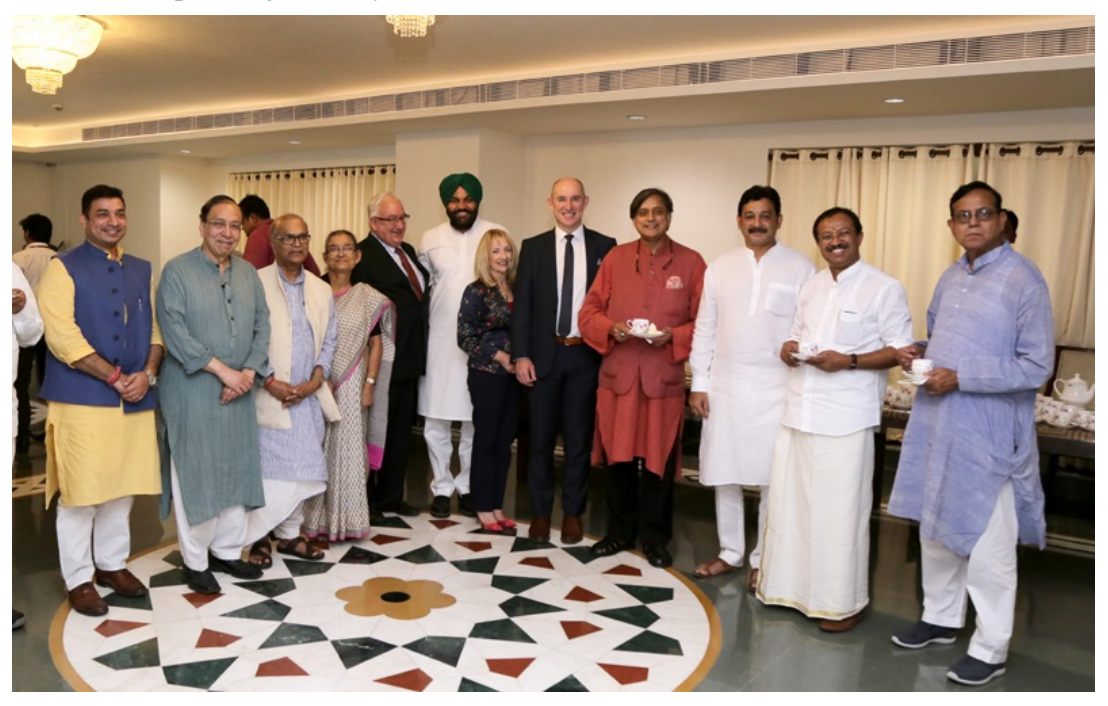
The delegation enjoys afternoon tea with members of the Standing Committee on External Affairs, including Chairman Dr Sashi Tharoor (centre)

2.16 The meeting also discussed issues of trade agreements and tariffs; although the Committee on External Affairs noted that it does not have a formal view on these issues which are the primary responsibility of the Standing Committee on Commerce. However trade is necessarily important to external affairs, and the meeting discussed the positioning of Australia and