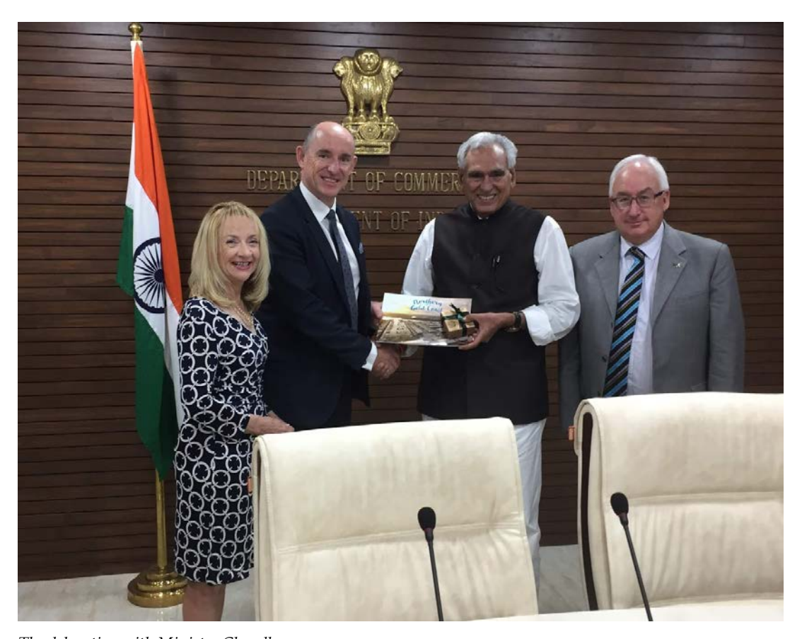
The delegation with Minister Chaudhary