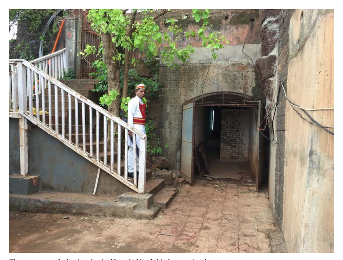
The entrance to the bunker that had been hidden behind vegetation for over a century

3.17 The delegation walked through the bunker, which still has ventilation and drainage systems and a number of entrances to different points in the grounds. The Governor explained the significant historical importance of the site, and his plans for allowing tourists to visit.