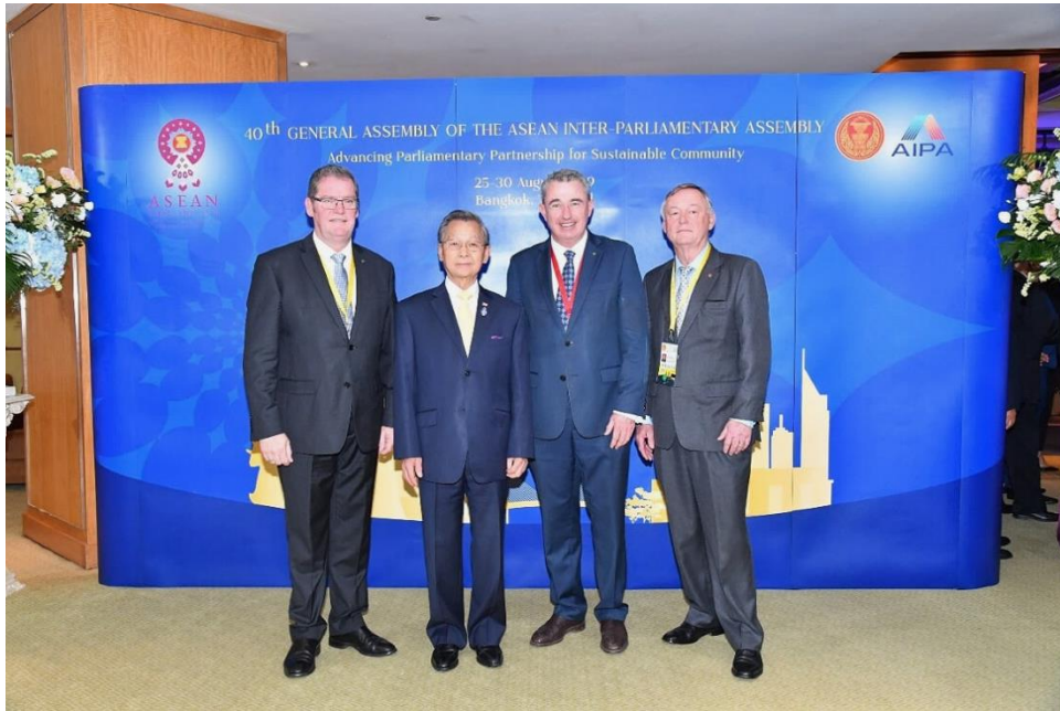
The delegation with HE Chuan Leekpai, President of AIPA.