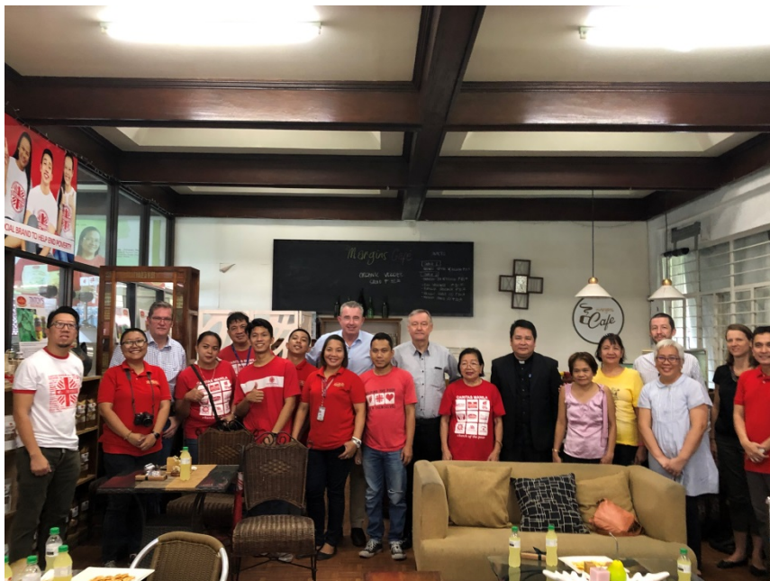
The delegation with volunteers from Margins café.