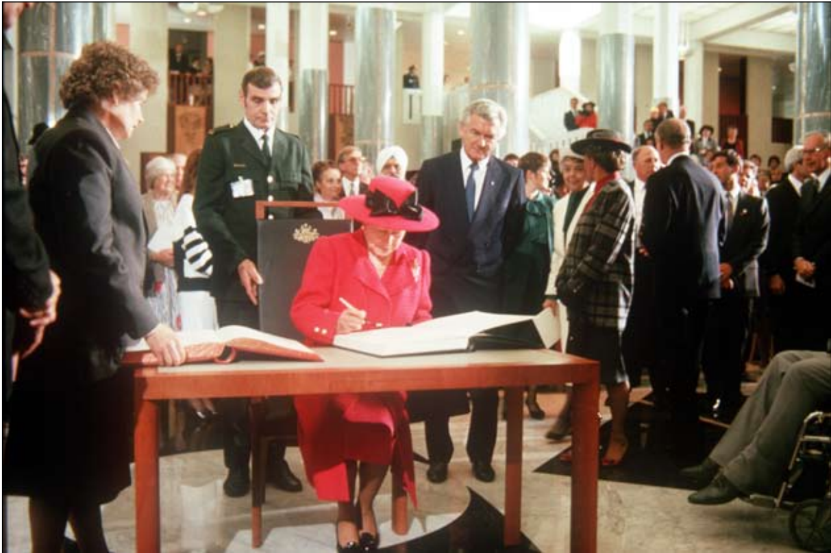
The Queen signs the visitor's book at the opening of New Parliament House in 1988